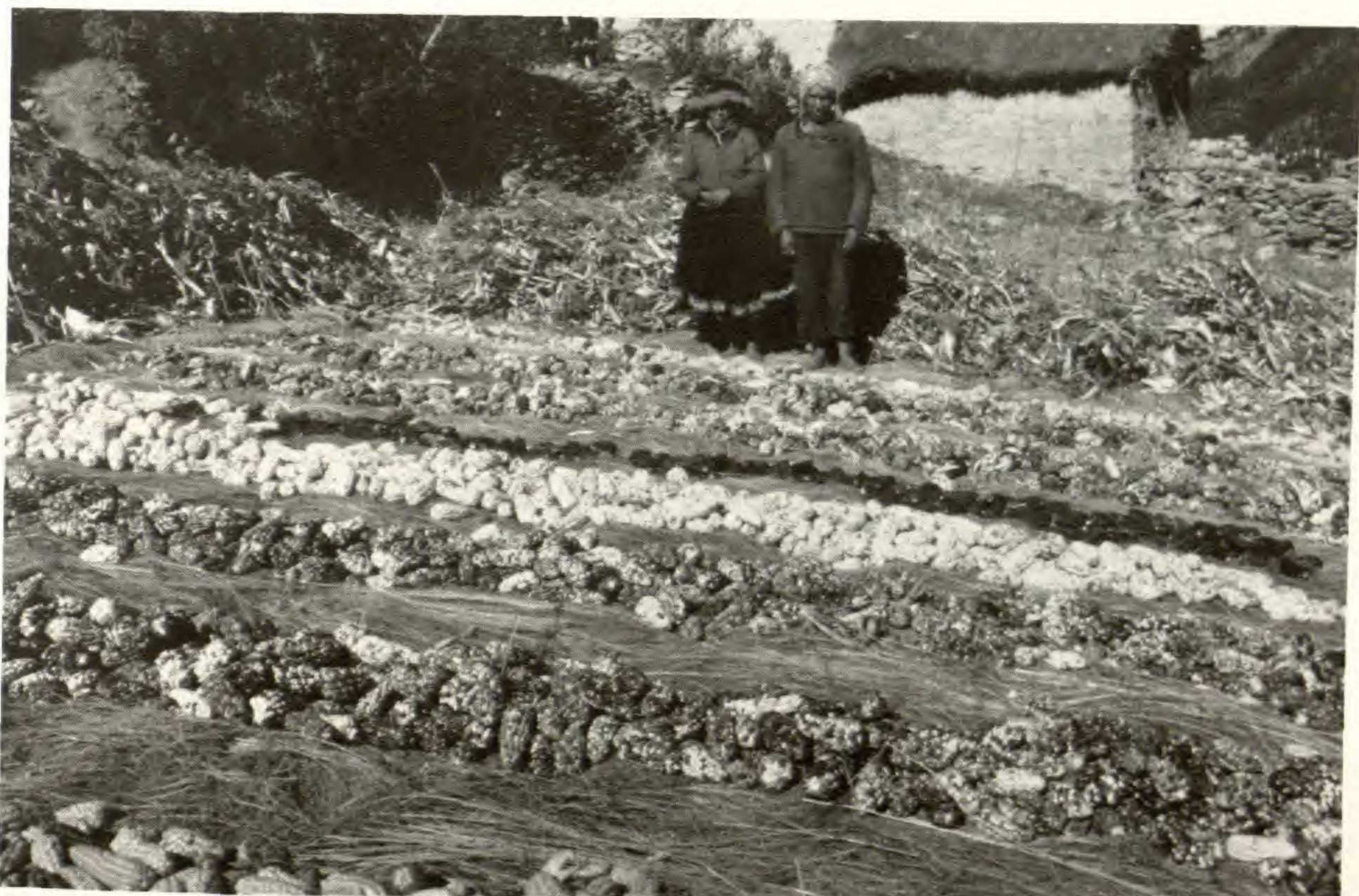
FIG. 3.—Harvested ears of boiling and parching maize separated by cultivar type on the “drying floor” (highland Paucartambo).

in nearly all subsistence fields. Two practices in particular indicate rationales for the polycultivar composition of maize fields. First, many cultivars preferred consumption differ from those possessing esteemed production traits within the same use-category. Chullpi , for instance, is widely thought to be the best-tasting cultivar among the parching ( hank'a ) types although others such as leche parakay are much preferred for their yield. Secondly, single maize fields sometimes include more than one “field planting.” Different sections of the field are effectively managed as separate “field plantings.” As a consequence of this practice, certain fields contain maize types for both parching and boiling, thereby including as many as four or five cultivars, each of which is designated for a specific production or consumption attribute.